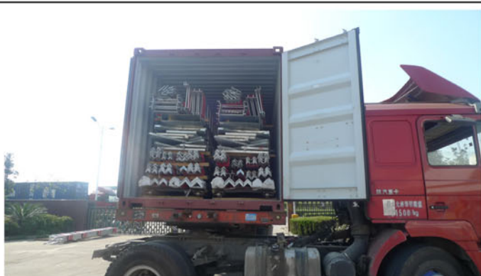
Loading of TEU containing 2 complete 50m towers