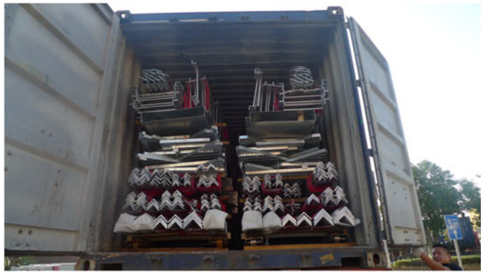
Loading of TEU containing 2 complete 50m towers