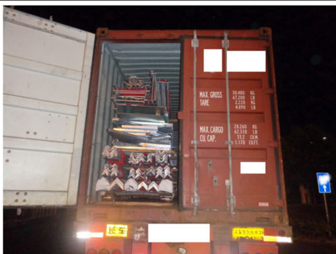
Loading of TEU containing 2 complete 50m towers