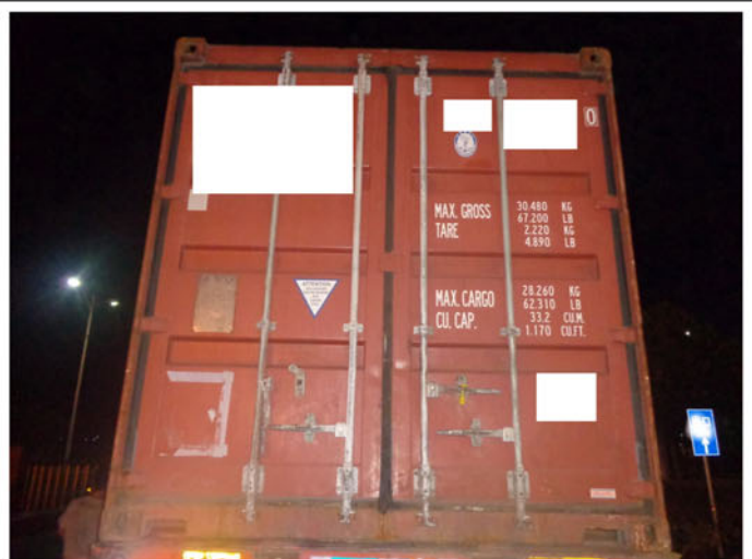
Loading of TEU containing 2 complete 50m towers