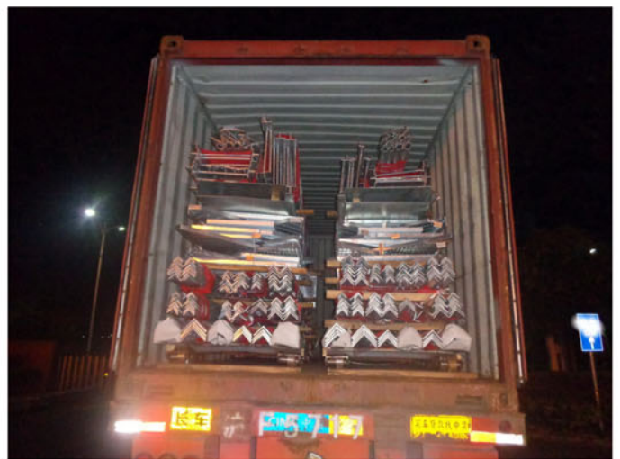
Loading of TEU containing 2 complete 50m towers