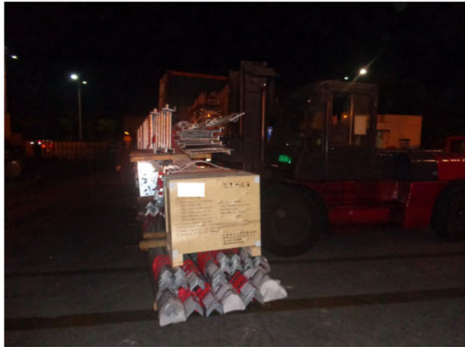
Staffing of containers