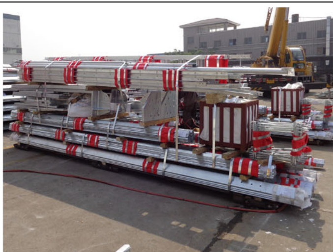
Completed loaded trolley