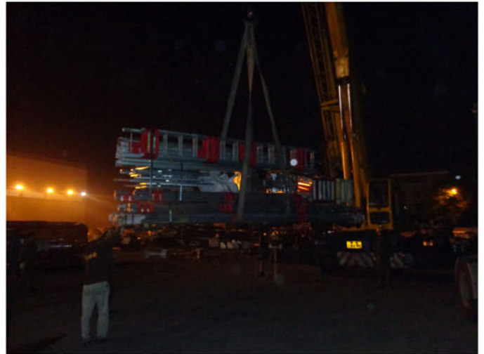
Staffing of containers