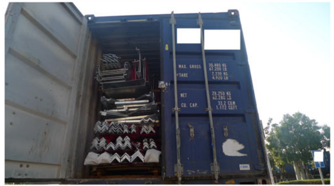
Loading of TEU containing 2 complete 50m towers