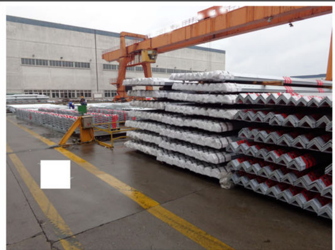
Ready packed parts – Main legs