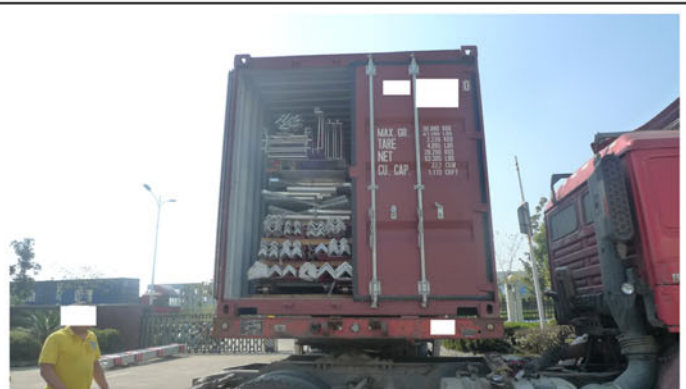
Loading of TEU containing 2 complete 50m towers