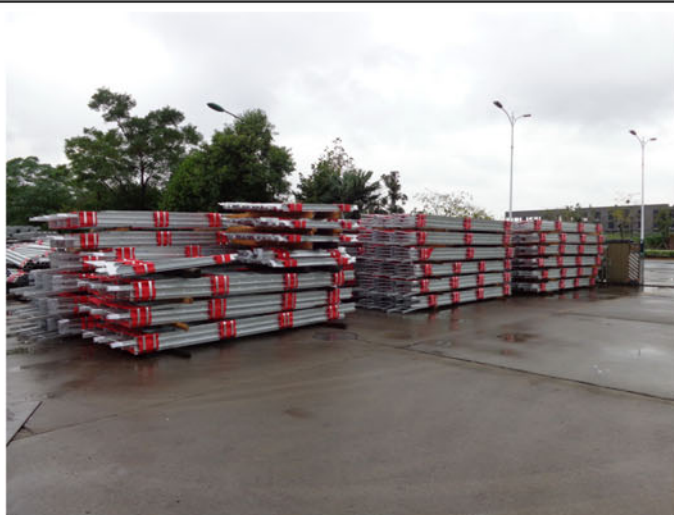
Ready packed parts – Vertical Climbing ladder