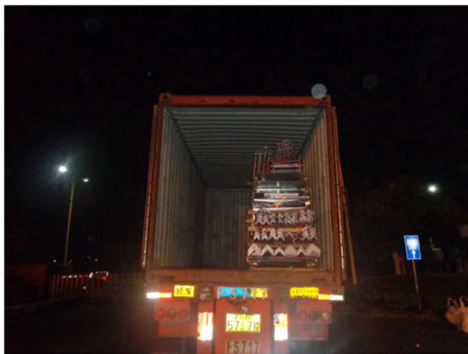
Loading of TEU containing 2 complete 50m towers