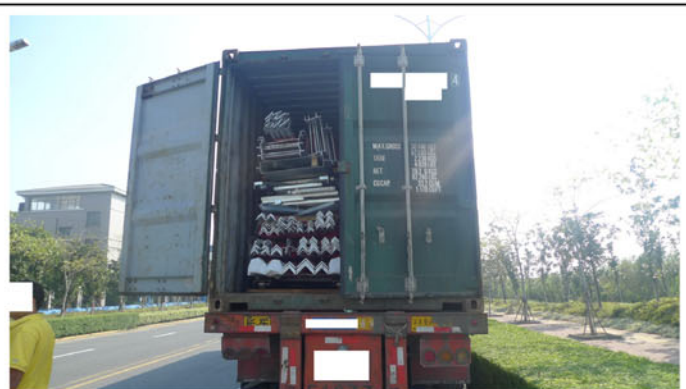
Loading of TEU containing 2 complete 50m towers