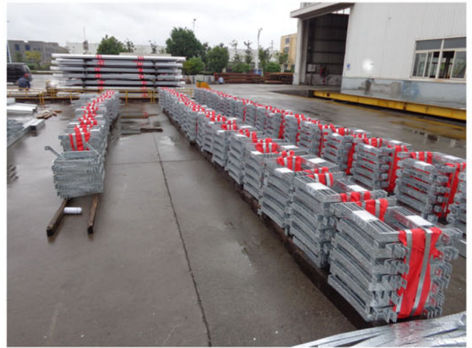
Ready packed parts – Vertical cable ladder