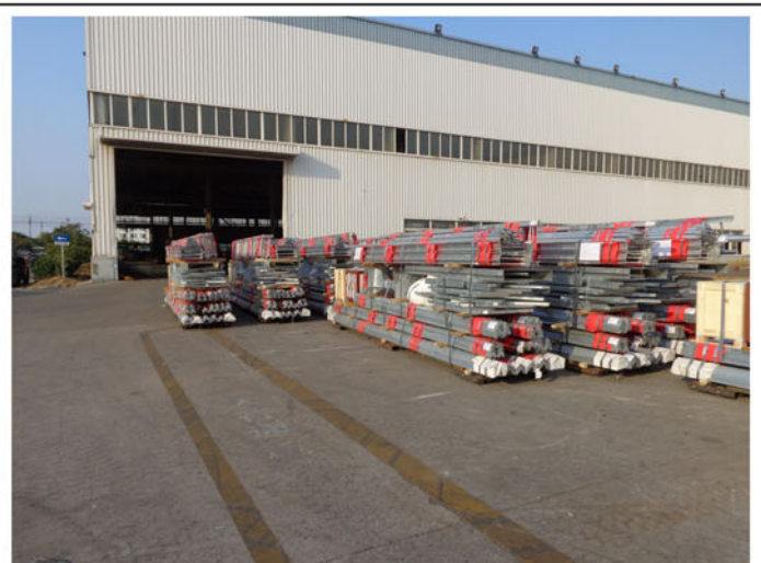
Several trolleys ready for container stuffing