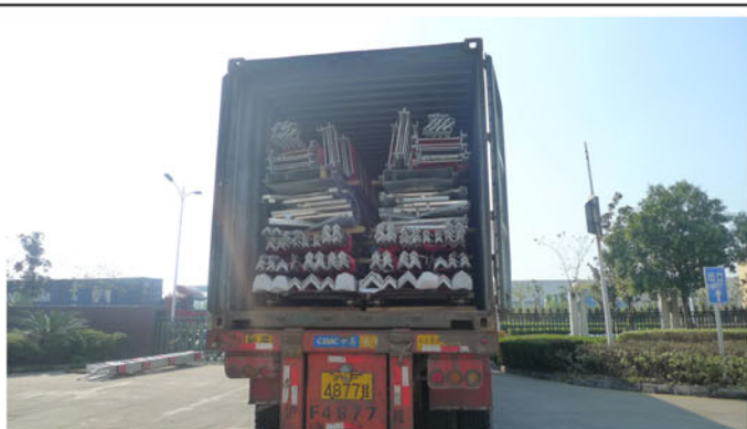
Loading of TEU containing 2 complete 50m towers