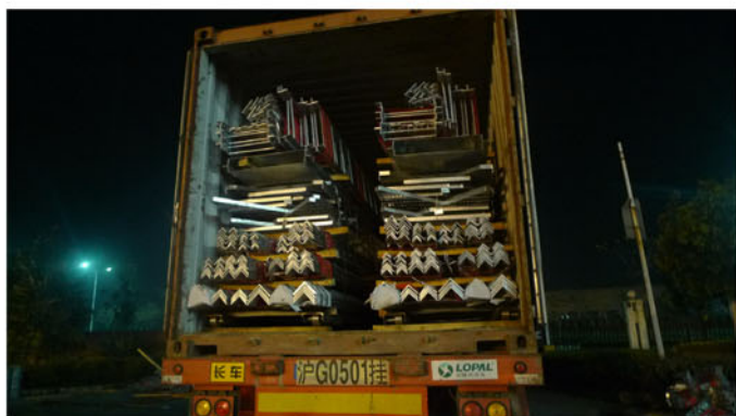
Loading of TEU containing 2 complete 50m towers