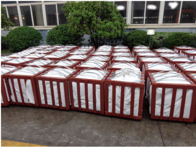
Ready packed parts - Tower connection plates